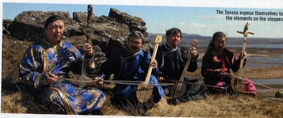
The Tuvans expose themselves to the elements on the steppes